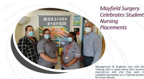
Mayfield Surgery Celebrates Student Nursing Placements

We have had some good news stories from across the County. We published stories from both the Rothwell & Desborough Surgery and Mayfield Surgery about their success with Student Nurses. Please visit our news pages on the website to see the detail. https://www.northantstraininghub.nhs.uk/about/news